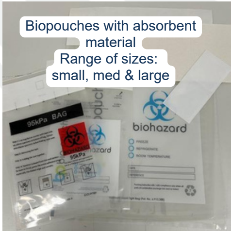
Biopouches with absorbent material Range of sizes: small, med & large