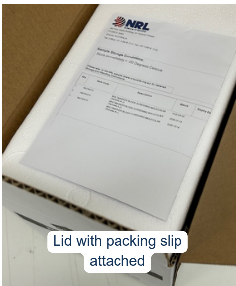
Lid with packing slip attached