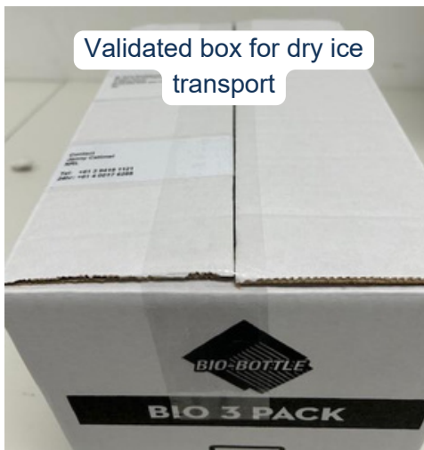
Validated box for dry ice transport