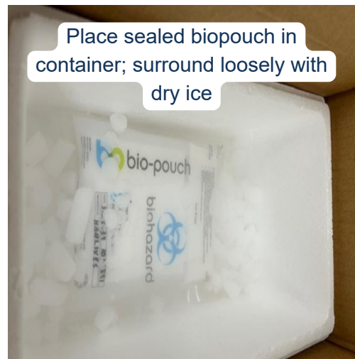
Place sealed biopouch in container; surround loosely with dry ice